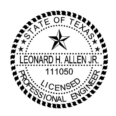
END OF ADDENDUM NO. 1