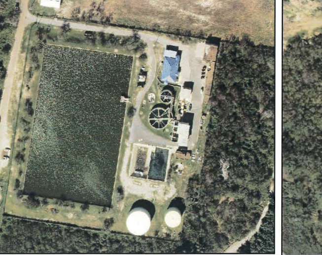
Lift Station No. 12 Champion St., Port Isabel