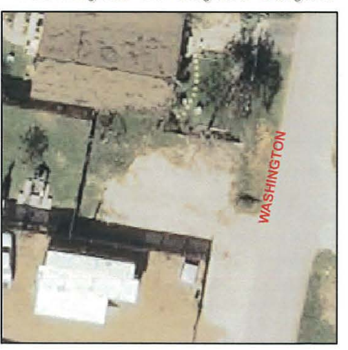
Washington St. Laguna Heights

Water Treatment Plant No. 2 1 1/2 Mile W. of Town of Laguna Vista on Hwy 100