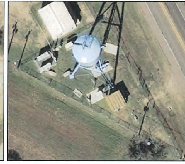
Storage Tank #5 Corner of Coolidge & Pennsylvania, Laguna Heights