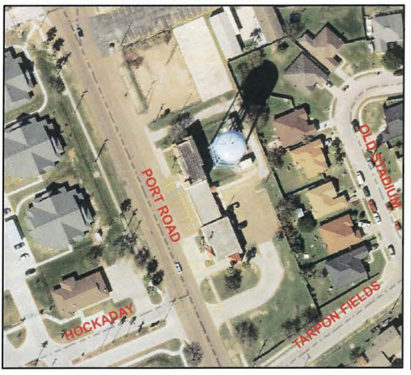
Lift Station No. 7 501 Island Ave, Port Isabel