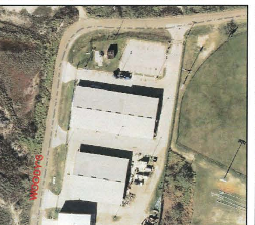
Lift Station No. 10 12001 Hwy 100,. Port Isabel