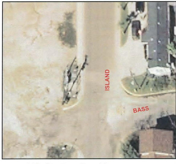
Lift Station No. 16 399 South Shore, Pl